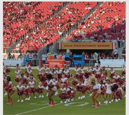
Lamorinda's Jr Gold Rush cheerleaders at a 49ers game on Aug. 18.